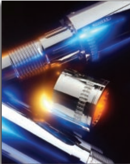
Our adjustable housing assemblies are designed and manufactured for the highest durability and ultimate in functionality.

NQL Energy Services manufactures all bearing assemblies, driveshafts, and adjustable housings with the highest level of quality assurance. We test and retest all new and rebuilt equipment before it leaves our facility, providing our customers with the most reliable and highest performance drilling motors.