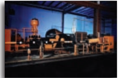
Our testing procedures and facilities provide you with the highest quality and most reliable drilling motors in the industry.

A larger torque handling capacity was obtained as a result of the development of larger internal components and connections. These features give BlackMax motors the ability to accommodate, with a comfortable factor of safety, the newest power sections now available on the market.